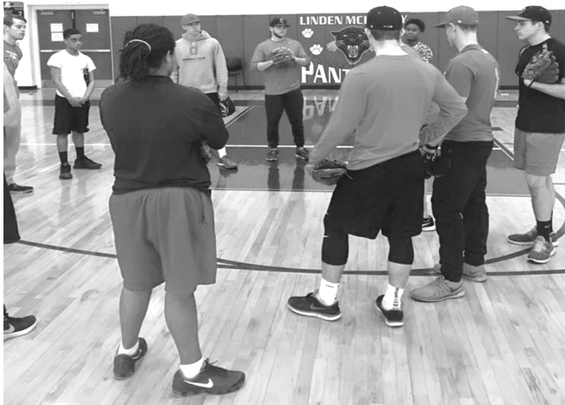
Ohio State University Baseball Club giving the Linden McKinley Baseball Team pointers for their positions.