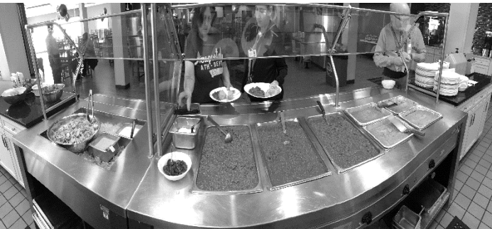
Meal prepared by Linden McKinley STEM Academy Students.